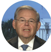
Honorable Robert Menendez Senator, New Jersey, United States Senate