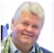
Hon. Greg Nickels 51st Mayor of Seattle