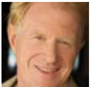
Ed Begley, Jr. Actor & Environmental Leader