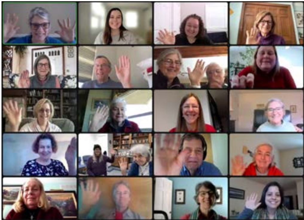
February 2022 Presbyterian Church (USA) Climate Ambassador Training; the training is available to all 1.5MM members

We also provide Ambassador financial incentives and local action microgrants in politically important states with higher than average BIPOC residents to motivate, reward, and compensate individuals and organizations for active climate action and advocacy.