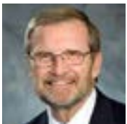
Phil Sharp, Chair ecoAmerica Board Chair, Former President, Resources for the Future