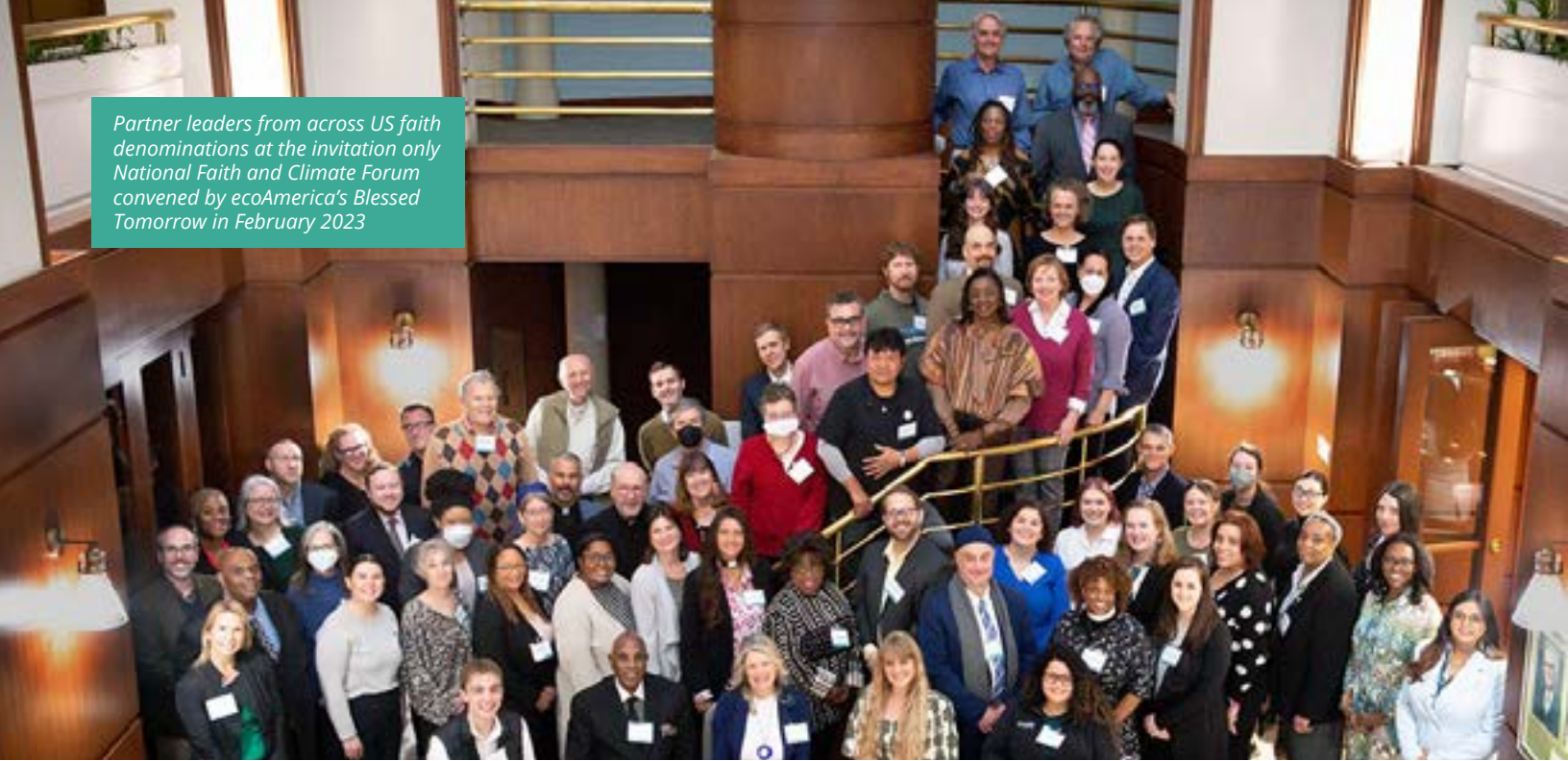
Partner leaders from across US faith denominations at the invitation only National Faith and Climate Forum convened by ecoAmerica's Blessed Tomorrow in February 2023

ecoAmerica moves society toward climate solutions by inspiring and empowering trusted national institutions and their millions of stakeholders in local communities across America to visibly act and advocate. Our mission is built upon our commitment to Justice, Equity, Diversity, and Inclusion.