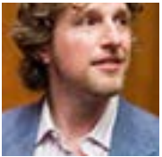
Matt Mullenweg Co-founder, Wordpress & CEO, Automattic